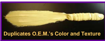
Duplicates O.E.M.'s Color and Texture

Seam Sealer # CTNT Mixer Nozzle # GTMN Gun # GTSU, # GF-21