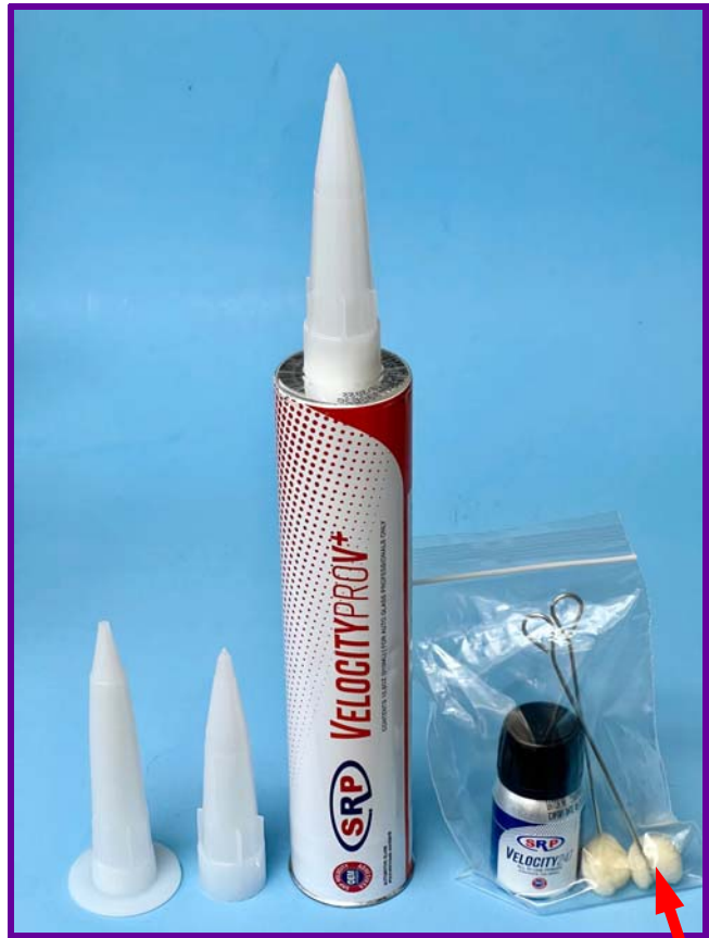
DAUBERS, 12 PACK # WDU