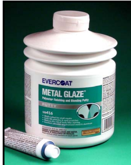
EVERCOAT METAL GLAZE # ZE416 30 oz bottle