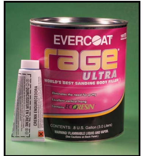
EVERCOAT RAGE ULTRA # ZE125