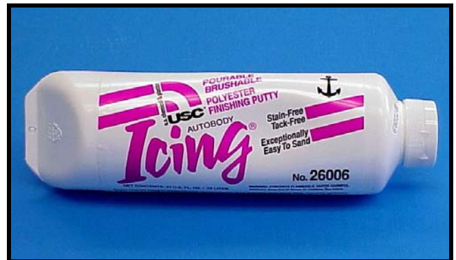
U.S.C. ICING # ZUI 24 oz TUBE