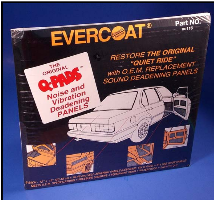
EVERCOAT Q PADS 6, 1' squares # ZE116