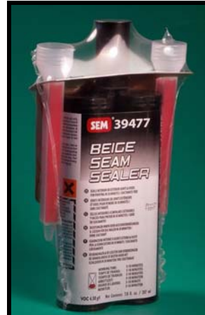
SEM SEAM SEALER BEIGE # S39477