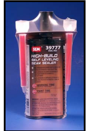
SEM SEAM SEALER Self Leveling # S39777