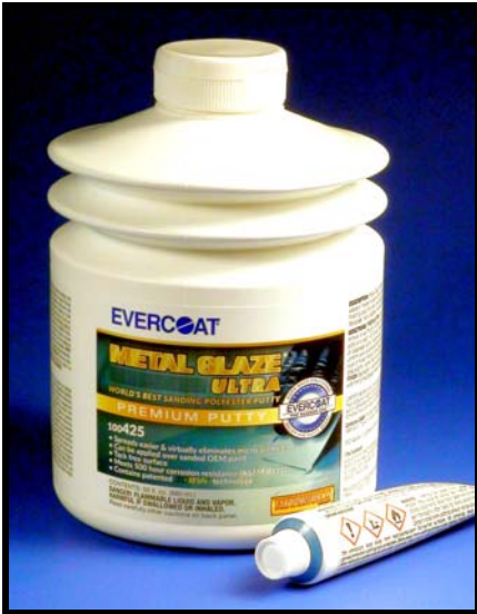
EVERCOAT METAL GLAZE ULTRA # ZE425 30 oz bottle