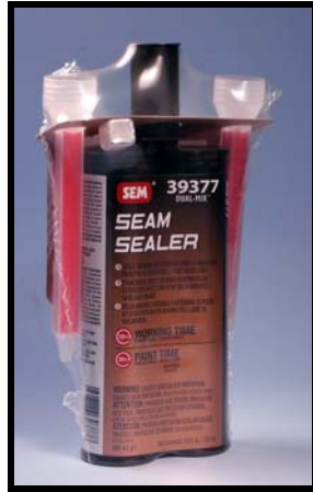
SEM SEAM SEALER STANDARD # S39377