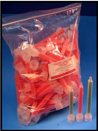
20 ELEMENT MIXER NOZZLE 100 per bag # SEMNR