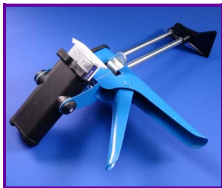
HEAVY DUTY Mini Twin Applicator Gun #GCMT2