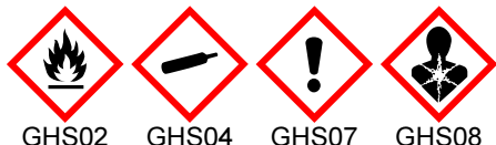
GHS02 GHS04 GHS07 GHS08